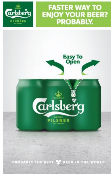
Above: Easy to Open packs for easier beer sharing

Ever had difficulty getting to your beers? Carlsberg is now making it even easier for everyone to grab a can of Carlsberg beer by introducing Easy-to-Open packs - an additional easy to open tear perforation to its current packaging. As with all good experiences, good beers are to be enjoyed with friends! The Easy-to-Open packs will also make it easier for consumers to relish in beer sharing moments.