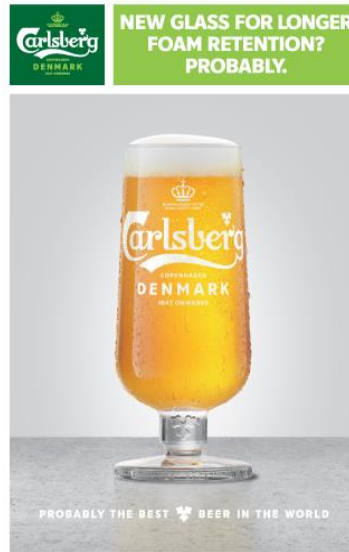
Above: Carlsberg new premium-looking stem glass for longer foam retention

Beer drinkers enjoying the same great brew served in the new premium-looking stem glasses can delight in an even better quality Carlsberg beer. The new stemmed glasses are bowl-shaped in design, allowing for a smoother pour and comes with a tapered mouth for a more aromatic beer with 25% better foam retention. Its tailored nucleation glasses also help to create a steady stream of bubbles and maintains the head on the beer - giving you a better beer drinking experience.